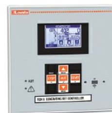
Automatic mains failure gen-set controllers RGK600