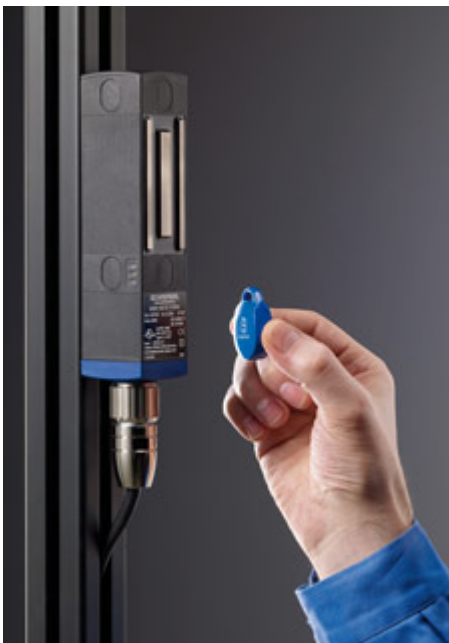
Product in the environment

K.A. Schmersal GmbH & Co. KG, Mödinghofe 30, D-42279 Wuppertal