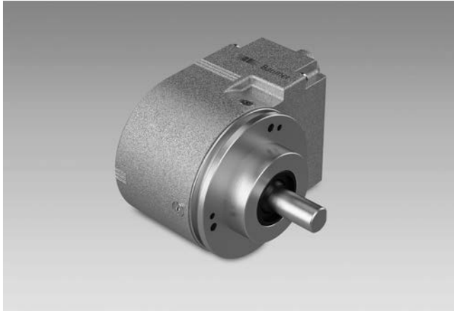
EAL580-SC with clamping flange