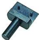
Adapter for magnetic stand; D8mm for Surftest SJ-210 / SJ-310 12AAA221 Suggested retail price: 45.00 €*