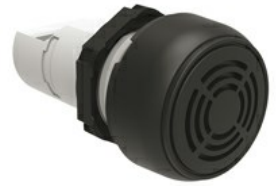
Monoblock buzzer - Continuous or pulse tone LPCZS