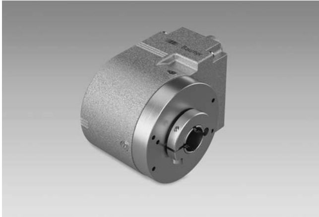
EAL580 with through hollow shaft