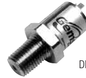
DIN 43650C Industrial