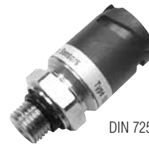
DIN 72585 Bayonet