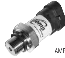
AMP Superseal 1.5