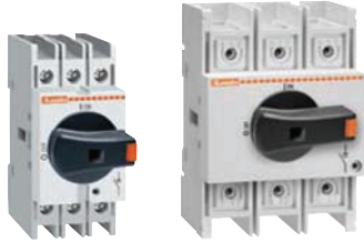
GA016 A... GA040 A GA063 SA