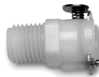
Typical shown: 1/4" NPT Male Pipe Thread with Shut-off Valve

These adapters are available with or without an integral shut-off valve. The shut-off valve will stop line flow when the adapter is removed from the unit. Flow resumes when connected.